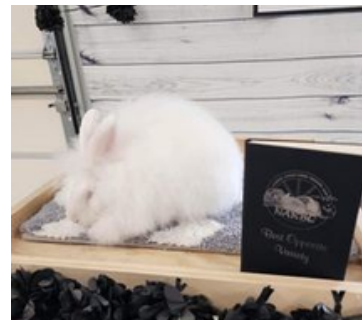
Stacie Archuleta-BOSV Satin Angora