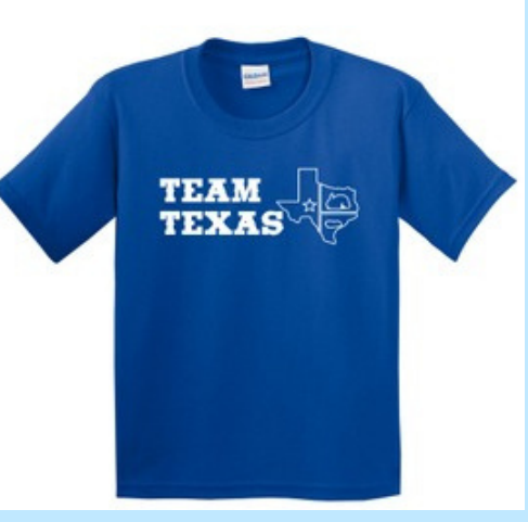
Sizes Youth XS to Adult 3X Multiple color options